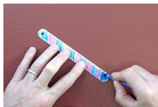
1. Decorate BOTH sides of the tongue depressor.

First, play the short Noisy Toy introductory video that is posted at www.schooloftoy.com/ondemand-power-of-toymaking . Then, walk students through the instructions below to make the toy.