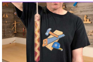
5. Stop and let it spin like a top.