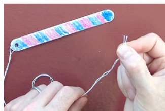
3. Make ends even.