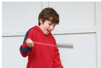
4. Whirl for ROARING sound!